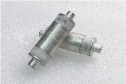
■ External view